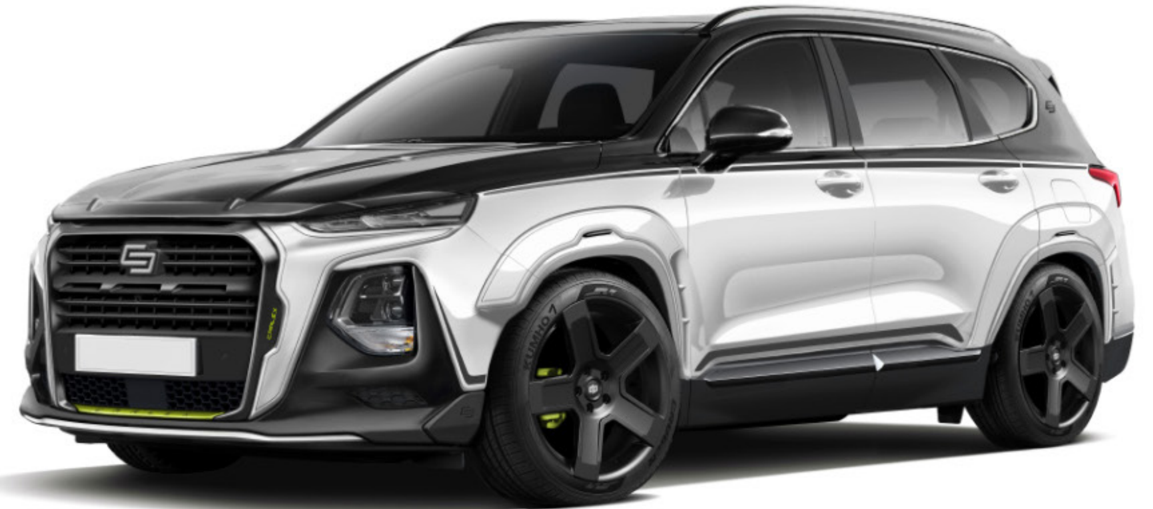
EXTERIOR BASIC CONVERSION